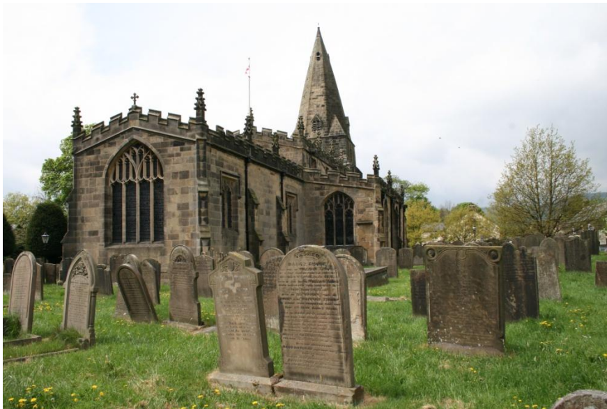
Figure 3. St Peter's Church, Hope is probably on the site of the original Saxon church.