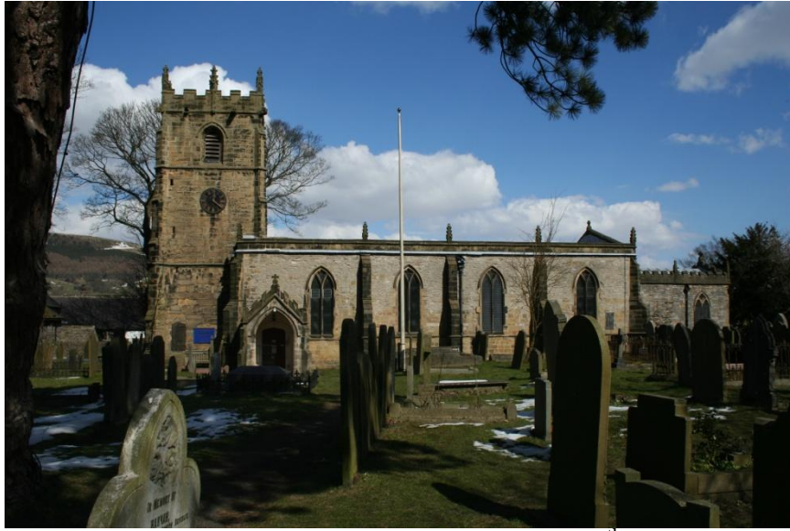
Figure 4. St Edmund's Church, Castleton with its 14 th Century tower.

in the south wall of the nave, all evidence of the present church's early origin. There are also the remains of an early cross in the churchyard (Parkin, Harrison & Fowler [n.d.]).